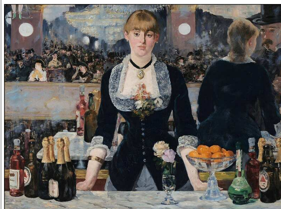
A Bar at the Folies-Bergere by Manet

The Impressionists, during their heyday of the 1870's, developed new ideas as to how to make art and to what subjects were possible and proper for a contemporary artist. Their legacy continues and many artists are still directly influenced by them, but more importantly, they opened doors for succeeding generations to investigate new ideas. Ronnie studied drawing and painting at the Glasgow School of Art.